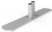
WLM-22L LEFT FOOT, DOUBLE HOLE