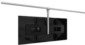
WLM-138 MONITOR BRACKET & VESA MOUNT W/CASE