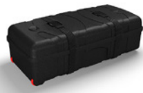
CA500 HARD SHIPPING CASE/ COUNTER