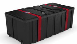
CA700 HARD SHIPPING CASE/ COUNTER