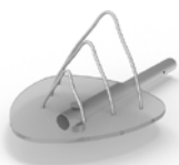
WLM-CH PLEXIGLASS BROCHURE HOLDER