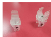
WLM-24L & WLM-24R DOUBLE C CLAMP