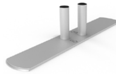
WLM-22R RIGHT FOOT, DOUBLE HOLE